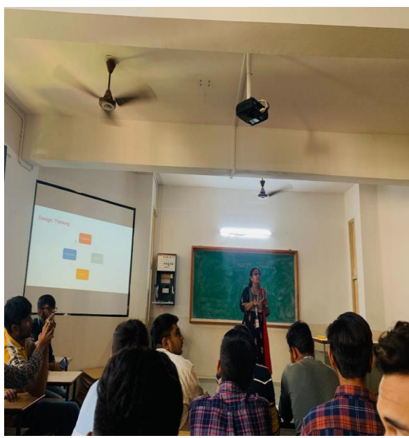
Steps for Design & Innovation Thinking