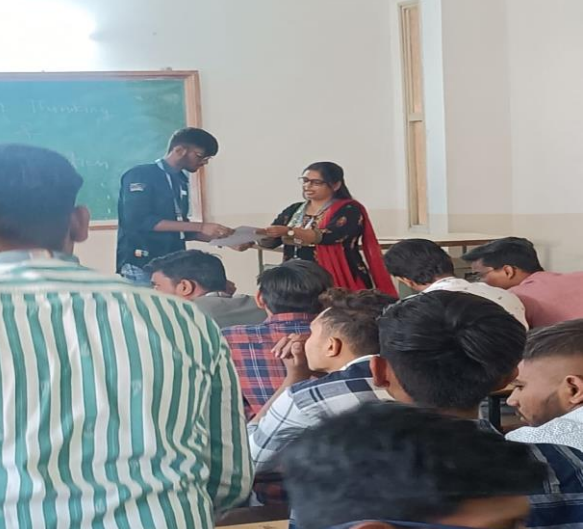
Preparing Ideation Cancas